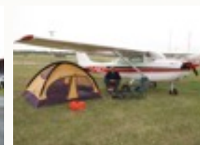
Home Sweet Home!