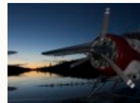
Beaver at Sunset. Watson Lake, 100 Mile House, BC