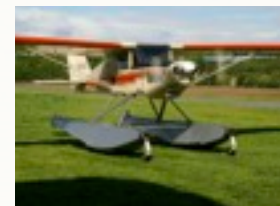
Our Amphibian flyers please use CZML as your "Go To"

The 108 Golf Resort* is located adjacent to the South Cariboo Regional Airport (CZML) and within easy walking distance from the Airport. We are holding numerous rooms and camping spots. Please call 1 800 667 5233 and mention group # 1982 to reserve your room at the BCFA Rate. This is the closest accommodation to the Meeting which will be held at the "Wheel-Room" on the Airport.