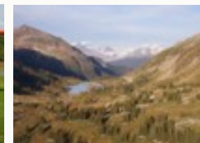
Cariboo Mountain Scenery