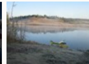
Barnstormers Inn. Watson Lake, 100 Mile House, BC