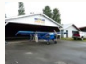
100 Mile House Hangar & Club House.